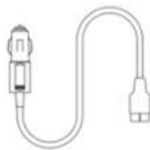
12V-14V car charger cable